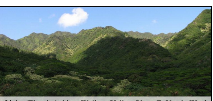
O'ahu 'Elepaio habitat, Wailupe Valley.

Status: The O'ahu 'Elepaio was formerly considered a subspecies ( Chasiempis sandwichensis ibidis ), but in 2010 it was split into a separate species based on morphological, genetic, and behavioral evidence (VanderWerf 2007, VanderWerf et al. 2009). It is listed as endangered under the U.S. Endangered Species Act and by the State of Hawai'i using its previous taxonomy. The Kaua'i 'Elepaio ( C. sclateri ) and Hawai'i 'Elepaio