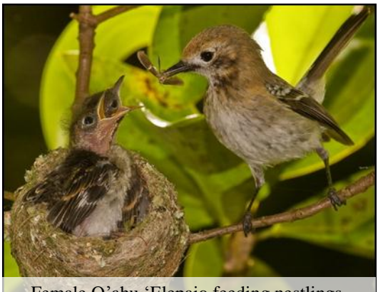
Female O'ahu 'Elepaio feeding nestlings.

Synopsis: The O'ahu 'Elepaio is an adaptable species that has persisted in low elevation, disease-plagued forests dominated by alien plants on the most developed of the Hawaiian Islands. The most serious threat to the species is predation on nests by alien rats, which take eggs, chicks, and even incubating females. Rat control has been the primary conservation tool and can be effective at reducing predation, but it must be implemented on a larger scale to reverse declines of more 'elepaio populations. O'ahu 'Elepaio in some areas are evolving to nest higher off the ground in response to rat predation. Forest restoration with native trees that are less attractive to rats might help decrease the need for rat control.